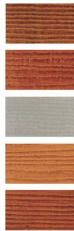
C 3 WoodTones