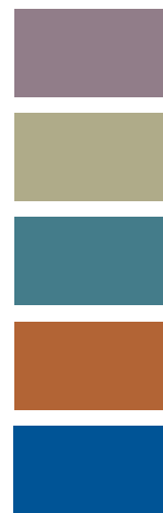
C 3 Solid Colors

74 Cabot® colors are available for C 3 Solid Colors, plus unlimited color matching